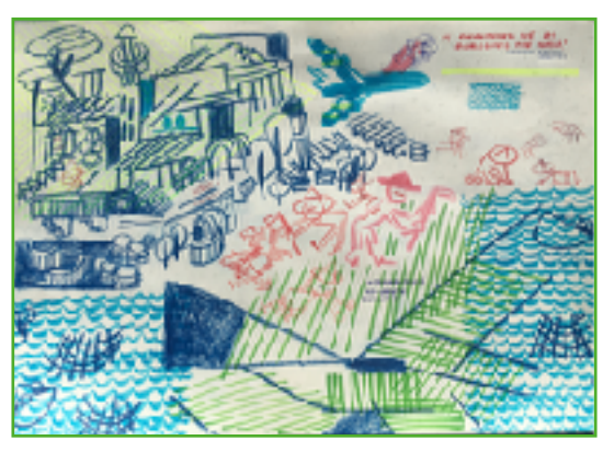
Is everything we do damaging the world? Because of the Covid19 pandemic, we've been reminded of how interdependent we are, and that an economy based on perpetual growth might not be sustainable. — Tommy vad Funderud Flaaten

Other developments have included a successful online workshop for Quakers across Europe, where Maud Grainger led an paper-based exploration. (Here is one of the creative responses, from a Norwegian Quaker). Online events for other community groups are also in the pipeline, as well as those open to everyone.